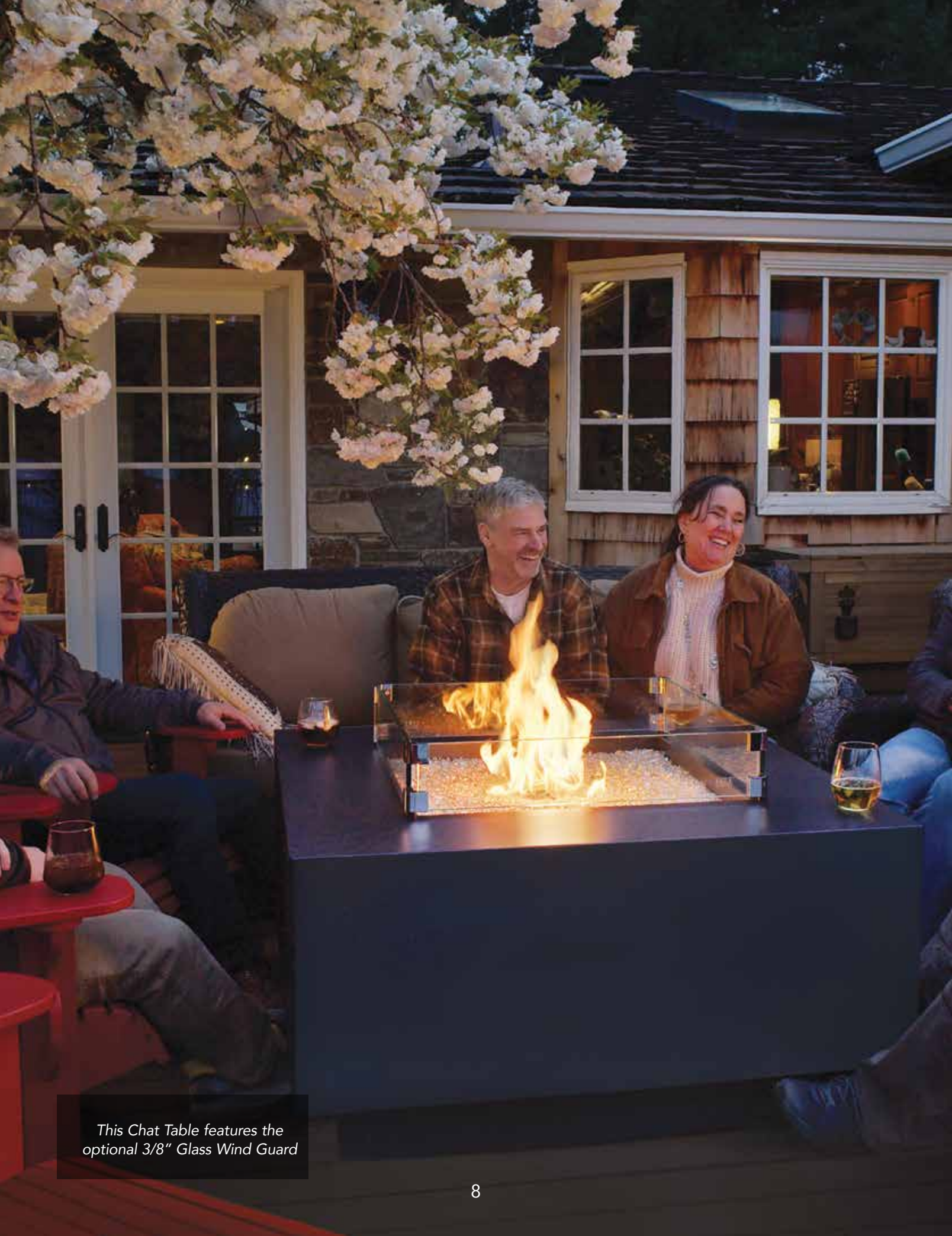
This Chat Table features the optional 3/8" Glass Wind Guard