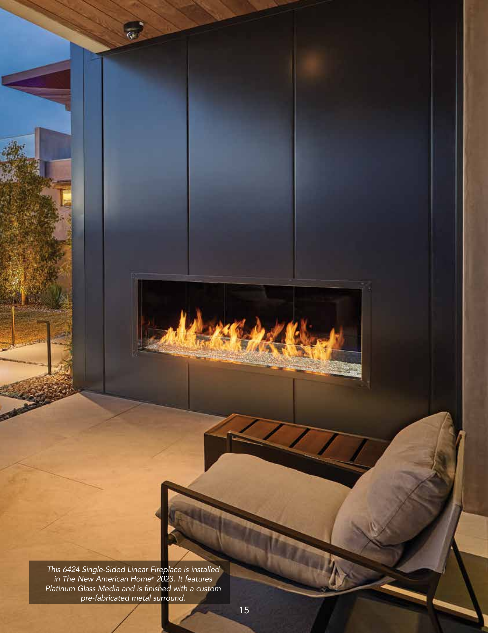
This 6424 Single-Sided Linear Fireplace is installed in The New American Home® 2023. It features Platinum Glass Media and is finished with a custom pre-fabricated metal surround.