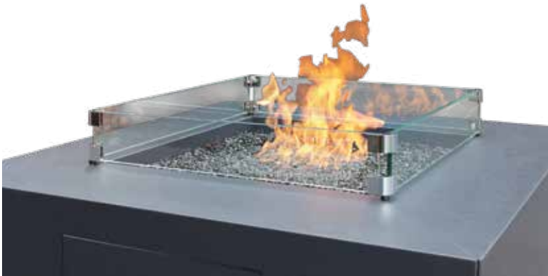
3/8" Glass Wind Guard