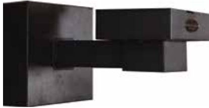
LANTERN WALL MOUNT