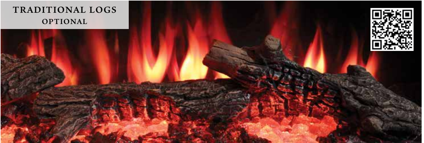
TRADITIONAL LOGS OPTIONAL