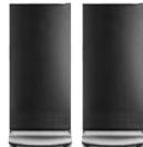
17.8 Cu. Ft. All Refrigerator (Qty 1) 17.8 Cu. Ft. Upright Freezer (Qty 1)