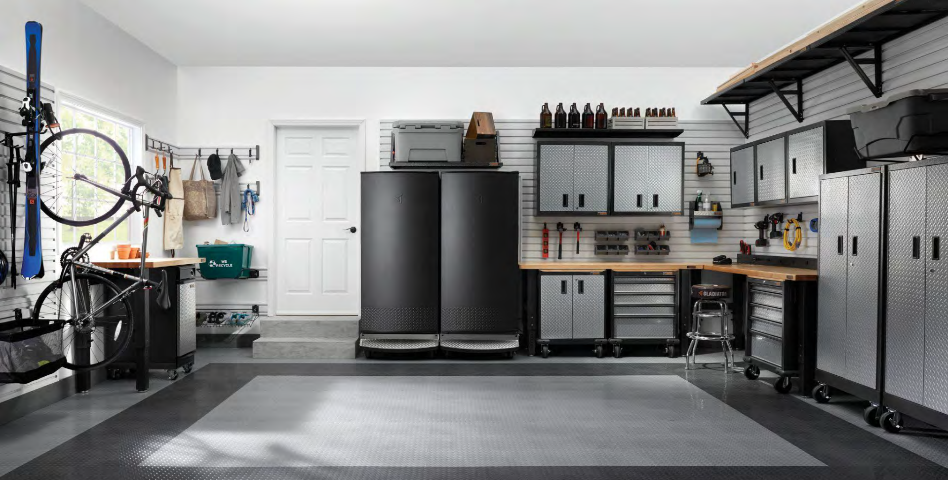
Image represents inspirational solutions that may include additional products and quantities.