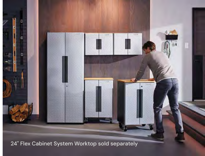
24" Flex Cabinet System Worktop sold separately

Wall cabinet can hang on GearWall® Panels, GearTrack® Channels or directly to the wall via included bracket.