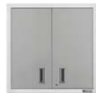
Premier Pre-Assembled 30" Wall GearBox (Qty 2)