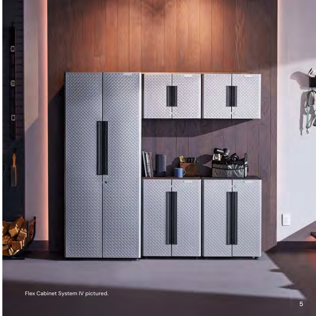
Flex Cabinet System IV pictured.

Wall cabinet can hang on GearWall® Panels, GearTrack® Channels or directly to the wall via included bracket.