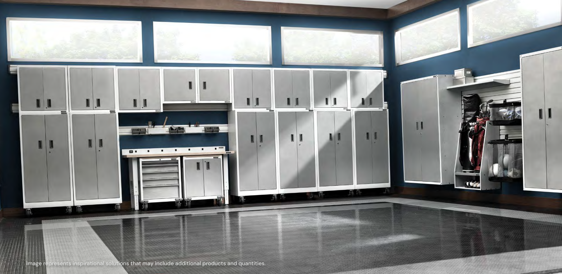
Image represents inspirational solutions that may include additional products and quantities.