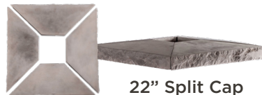
22" Split Cap