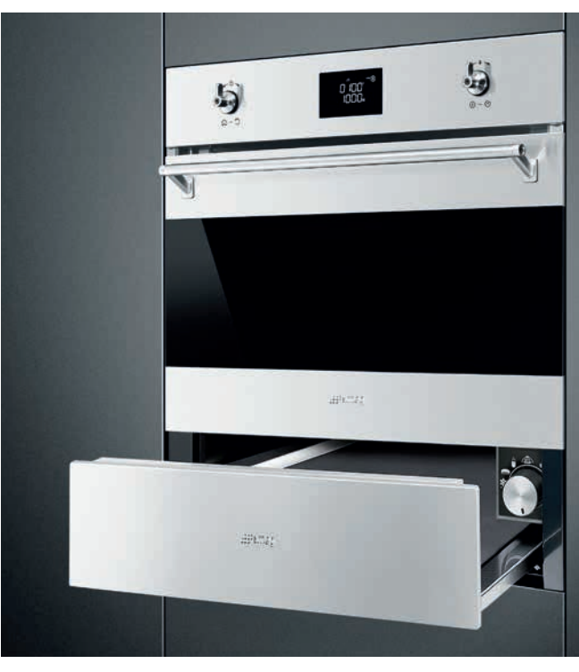
Shown above: Linea Steam Oven (top) and Classic Speed Oven with Warming Drawer (bottom).