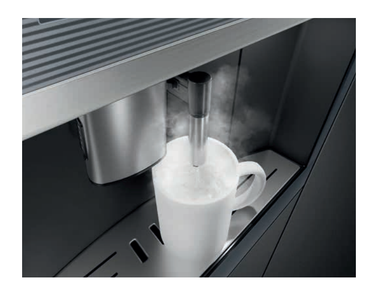
steam ovens speed ovens convection ovens (24", 30") storage and warming drawers coffee systems

Of course, coffee is a complement to any meal, and the Linea Collection allows you to create succulent cuisine, as well. Convection ovens, steam, and speed ovens, as well as storage and warming drawers, flank the offering, each with their unique provisions. Complete details on Linea products are found at smegusa.com.