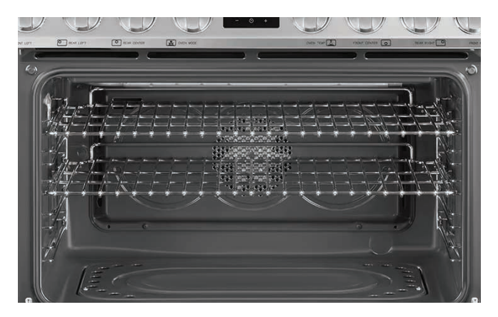
gas rangetops (30", 36") gas ranges (24", 30", 36")